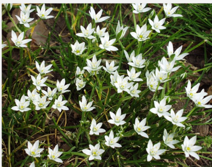
Star of Bethlehem flowers