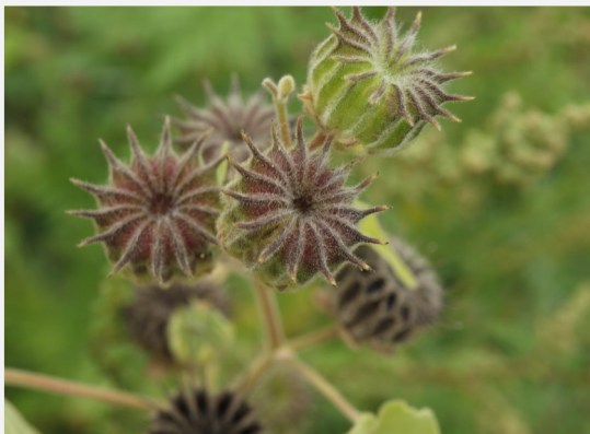
Velvetleaf seed pods Jordan Eyamie