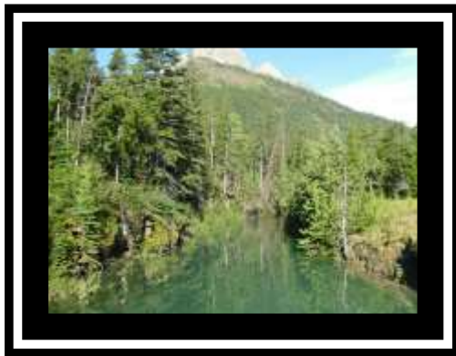
2 nd Place – Quiet creek and forest by Chris Budd