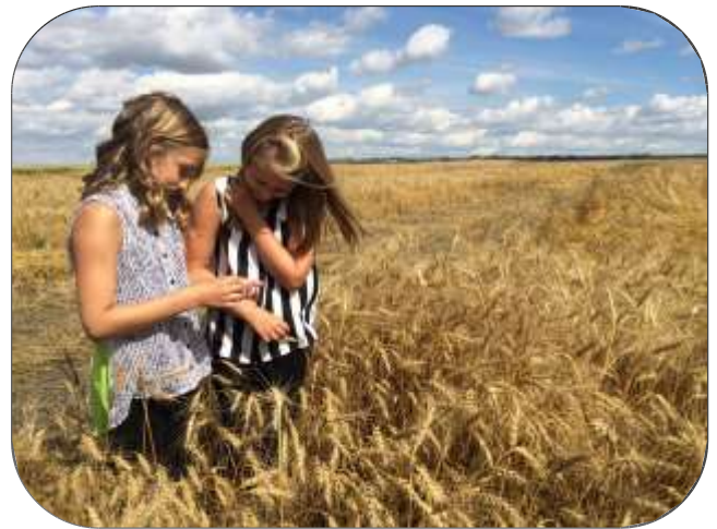
The future by Shaun Campbell