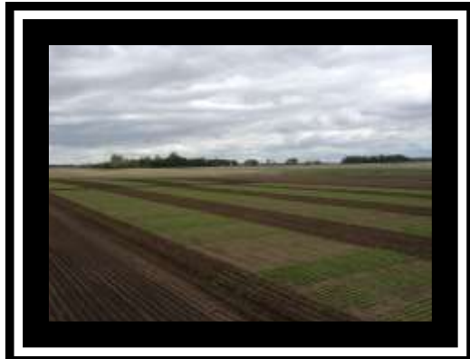
2 nd Place – Precision by Shaun Camp- bell