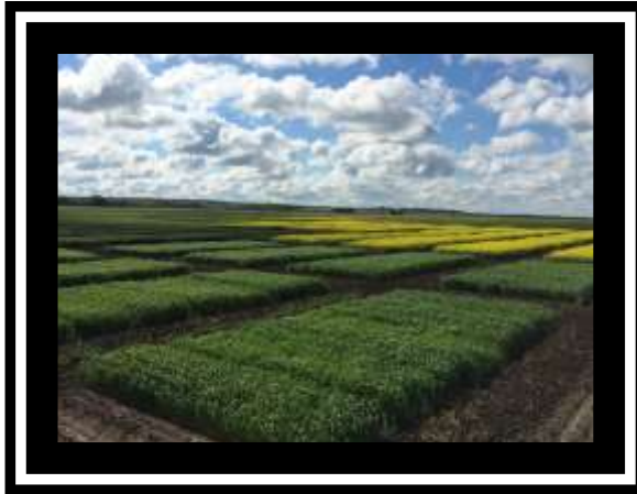
1 st Place - Pride by Shaun Campbell