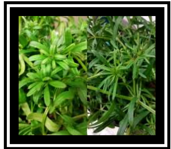
2 nd Place - Morphological Variation of Galium spurium by Andrea DeRoo