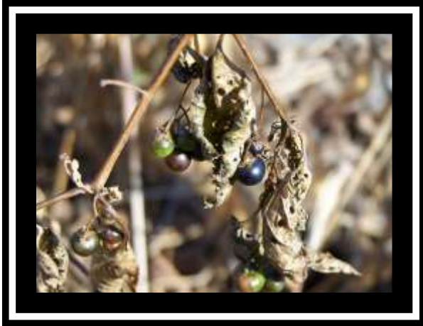
Weeds 3 rd Place – Night shade dessication 3 by Jean-Francois Foley